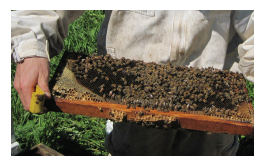
A hive inspection includes an evaluation of colony strength.