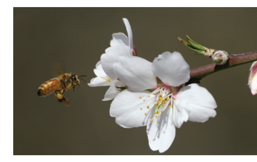
When walking orchards during bee flight hours, look for bees carrying pollen on their legs, which confirms that pollination is taking place.