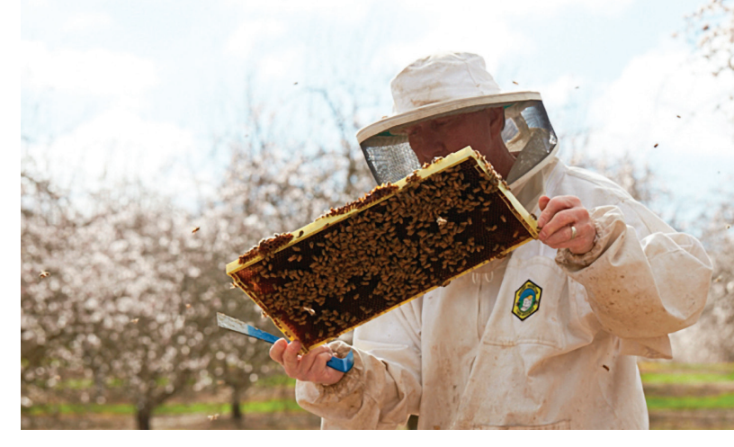
Hives should be inspected by an apiary inspector or the beekeeper as soon as bees arrive in the orchard.

Growers can further monitor colony strength by walking orchards daily during bee flight hours to observe activity levels. In addition, growers should record hives that appear weak (i.e., relatively few bees coming and going at the hive entrance) or inactive, and then report those hives to the beekeeper.