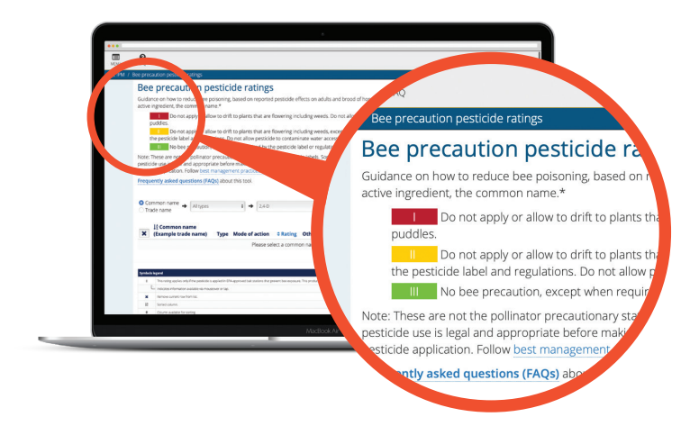
The University of California Statewide Integrated Pest Management Program provides guidance on bee precaution pesticide ratings at IPM.UCANR.edu/BeePrecaution.

Delayed dormancy is the period of time from the resumption of growth after dormancy — indicated by bud swell, up until green tip — which occurs around Feb. 1, depending on region, variety and weather. This period is followed by bloom. Post bloom begins after petal fall, which is typically in late March but may vary based on region, variety and weather. As shown in this image, bloom sprays made at night will minimize the exposure of bees and pollen to spray chemicals.