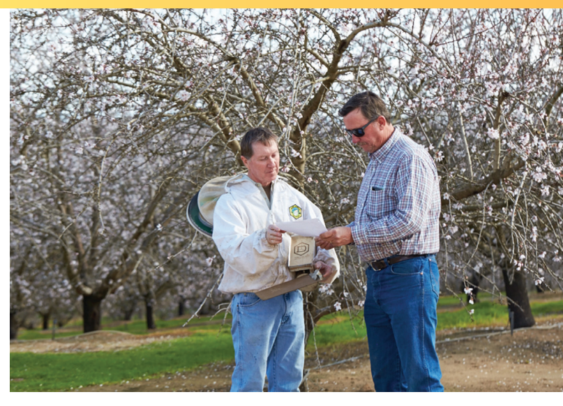
For successful pollination and safeguarding of honey bees, growers should contact beekeepers early and create an agreement that outlines the expectations of both parties.

Growers and beekeepers should outline and mutually agree on their expectations for each other to avoid misunderstandings. Communication on pesticide use during bloom, for instance, should be a fundamental conversation, and could involve outlining a pesticide plan that specifies which pest control materials might be used. The grower and beekeeper should agree on which products can be applied if a treatment is deemed necessary. Before bloom, when applications are imminent, it's important to establish a line of open communication between all who are involved in pollinating almonds and/or applying pesticides to