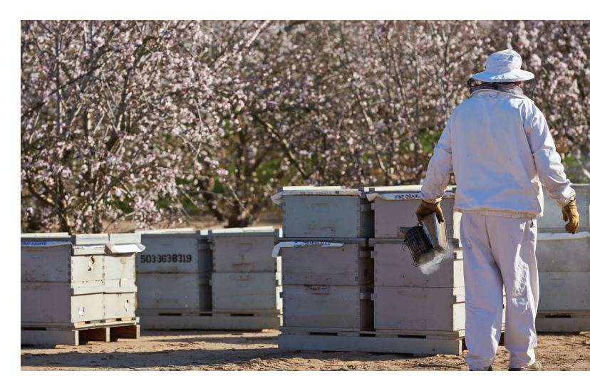
In cases of suspected honey bee pesticide-related incidents the area surrounding affected hives will be inspected.